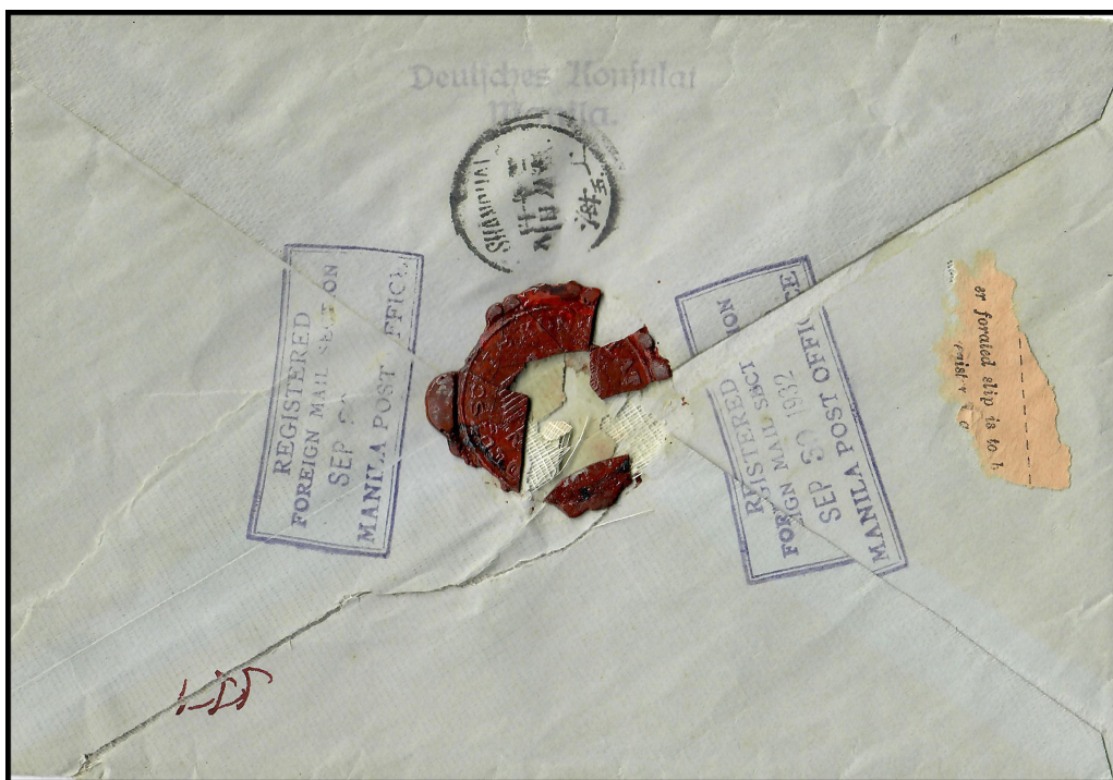
30 September 1932 – Registered Cover from Manila to Shanghai, China Stamps Cancelled with Circular Star Cancellation Rectangular Manila Boxed Registration Cancellations on Reverse Shanghai Circular Date Receiving Backstamp