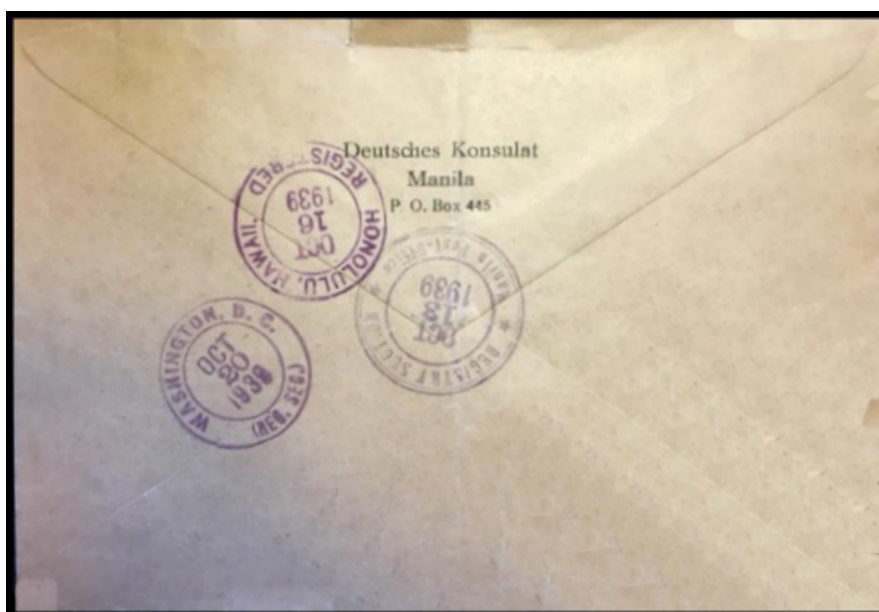
13 October 1939 – Registered Cover from Manila to Washington, DC, USA

Stamps Tied with Registration Killer Cancels with Registration Label (No. 20912) on cover front Honolulu, Hawaii (16 October 1939) Transit and Washington D.C. (20 October 1939) Receiving Backstamps