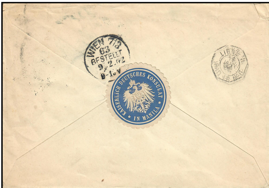
8 January 1902 – Cover from Manila to Wien (Vienna), Austria

Stamps tied with Manila (No. 1) Duplex Cancellation