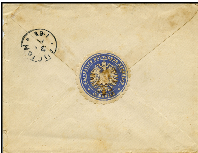
1889 – Cover from Manila to Aurich, Germany Four 2c Stamps Paying 8c Single Weight Rate to UPU Country Aurich (13 ?? 1889) Receiving Circular Date Backstamp

Provenance: Don Peterson Collection (Zurich Asia Auction – February 2012, Lot 2273)