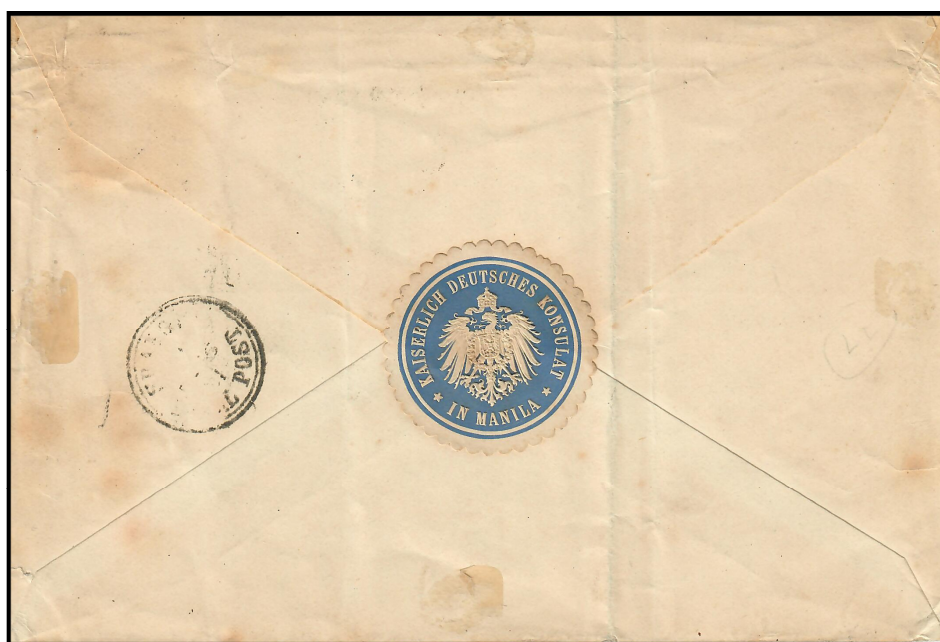
6 February 1901 – Cover from Manila to the Imperial German Consulate General, Shanghai, China 10c Stamp tied with Manila (No. 1) Duplex Cancellation, with indistinct Receiving CDS on Reverse