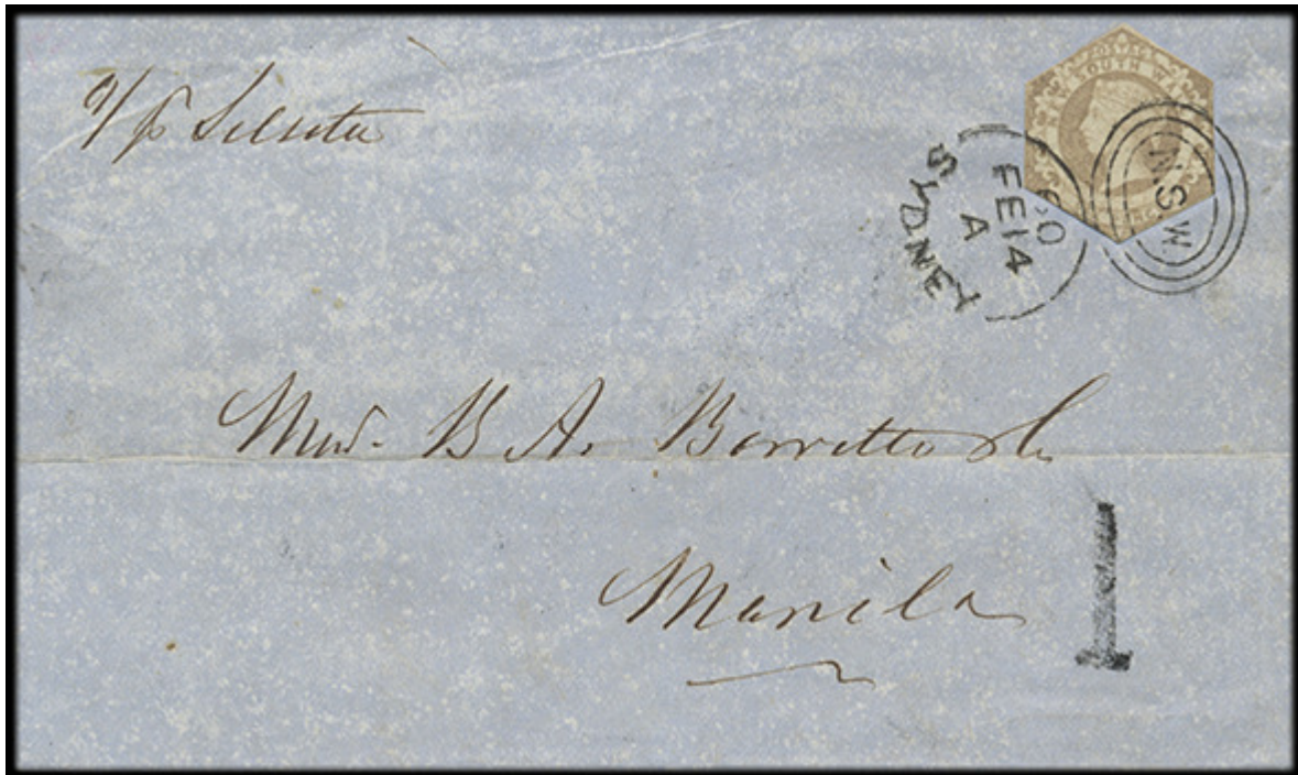
14 February 1860 – New South Wales, Australia to Manila Numeral '1' on front indicating payment due of 1-Real (Scan from Auction Catalogue)