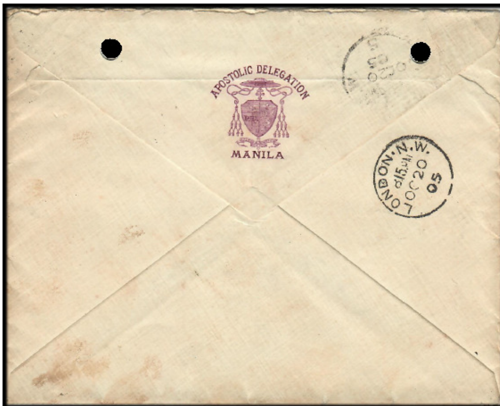
17 September 1905 - Cover from Manila to London, England