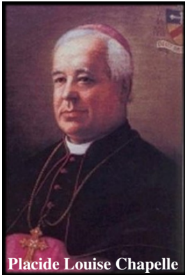
Placide Louise Chapelle

The Apostolic Delegation from the Catholic Church is a top-level diplomatic mission assigned by the Holy See sent to a specific country. Diplomatically, the Apostolic Delegation (later Apostolic Nuncio) is considered equivalent to an ambassador, and often carries the ecclesial title of Archbishop. The Delegate or Nuncio works closely with the country's Archdiocese, and is by custom by the Dean of the diplomatic corps.