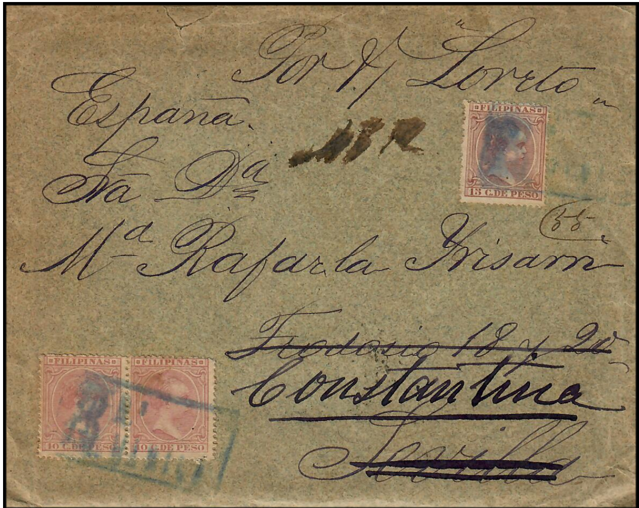
DATELINE: 29 MAY 1893 – REGISTERED COVER FROM MANILA TO SEVILLE, REDIRECTED TO CONSTANTINA, SPAIN