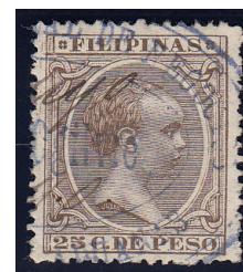
Scott #177 (1890)