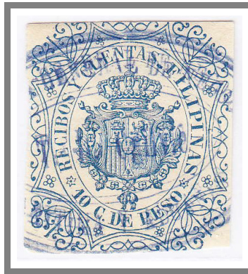
Recibos y Cuentas Fiscal (Warren #W-259)