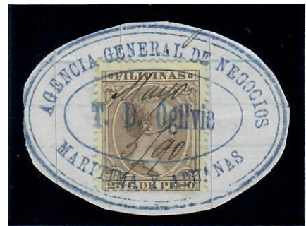
Scott #177 (1890)