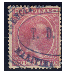
Scott #173 (1890)