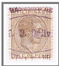
Scott #88 (1882)