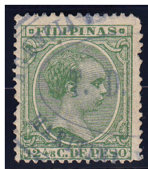
Scott #167 (1890)