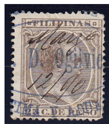
Scott #177 (1890)