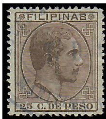
Scott #88 (1882)