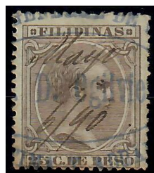
Scott #177 (1882)