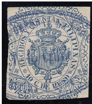
Recibos y Cuentas Fiscal Warren #W-259 (1890)