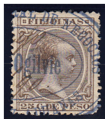
Scott #177 (1890)