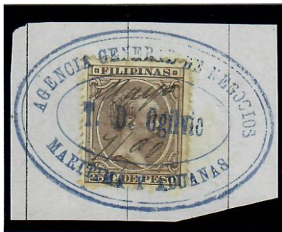
Scott #177 (1890)