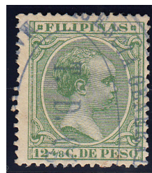
Scott #167 (1890)