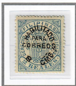
Scott #116 (PG-11)