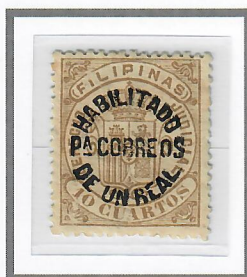
Scott #119 (PG-25)