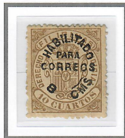
Scott #115 (PG-12)