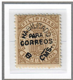
Scott #115 (PG-11)