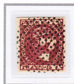
CIRCLE OF DOTS CANCEL