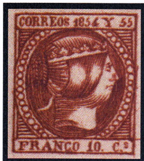
GENUINE (POSITION 33)