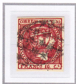
HANDSTAMP No 152