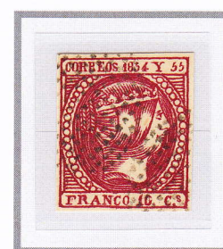
HANDSTAMP No 296

Gooding #2F3. Jean de Sperati Forgery. The sheet position copied is the 33rd stamp (third stamp in the seventh row). The central stroke of the 'F' in 'FRANCO' is very weak and is represented by little more than a dot. There is a white dot in the right side of the 'O' in '10'. The frame line half way up on the right is extended with a thinner line than in the genuine. Produced unused and used in carmine as well as unused in black. Photographic Prints. Produced by the British Philatelic Association in the 1950s, are also known. Some copies have a 'Sperati Reproduction' handstamp on the reverse.