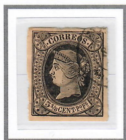
Manila - Star