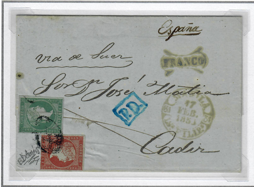
Dateline: 17 February 1853, Manipulated and Altered to Read '1858' by Black Pen