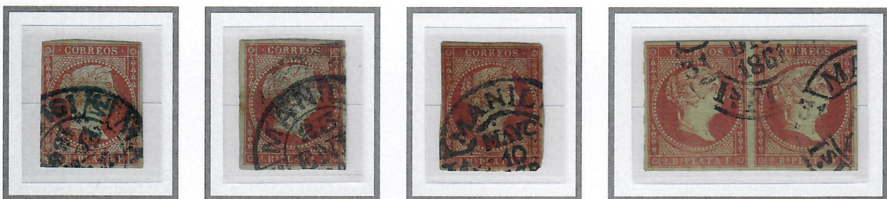
Bogus Baeza Circular Date Stamps