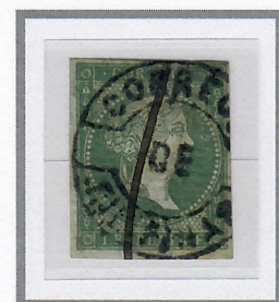
CORREOS DE FILIPINAS