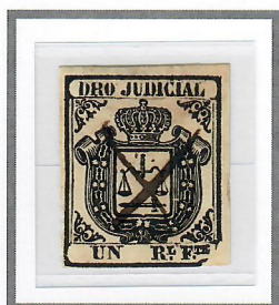
Bottom Right Corner Warren W-6