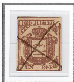
Top Right Corner Warren W-7