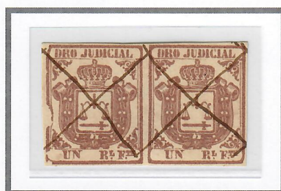
Left Stamp Showing Flaw Warren W-7