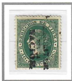
Warren W-41 (on W-36) Vertical Downward