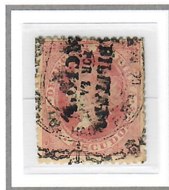
Warren W-43 (on W-38) Vertical Downward