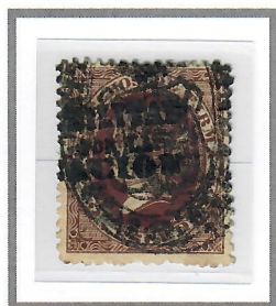
Warren W-42 (on W-37) Horizontal Overprint