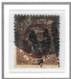
Warren W-42 (on W-37) Vertical Upward