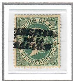
Warren W-41 (on W-36) Horizontal Overprint