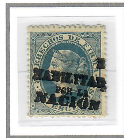
Warren W-44 (on W-39) Horizontal Overprint