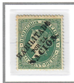
Warren W-41 Reprint Small First 'A'