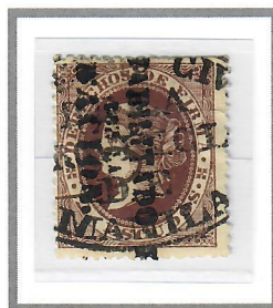
Warren W-42 (on W-37) Vertical Downward