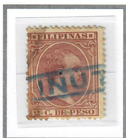
2c Claret (1894) Cliché I – Scott #144