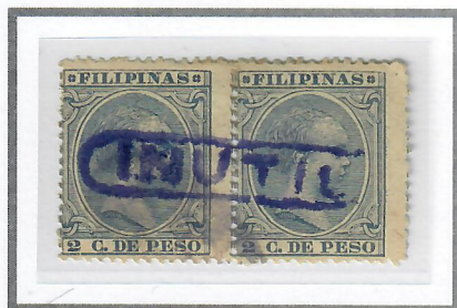
2c Ultramarine (1896) Cliché III – Scott #147