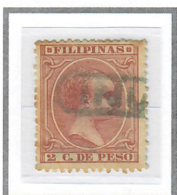
2c Claret (1894) Cliché II – Scott #144