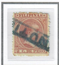
2c Claret (1894) Cliché I – Scott #144