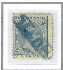
2c Ultramarine (1896) Cliché III – Scott #147