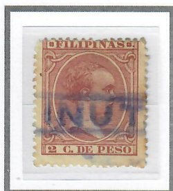
2c Claret (1894) Cliché I – Scott #144