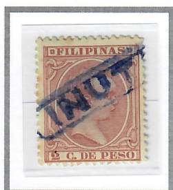
2c Claret (1894) Cliché I – Scott #144