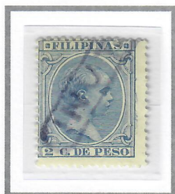
2c Ultramarine (1896) Cliché III – Scott #147