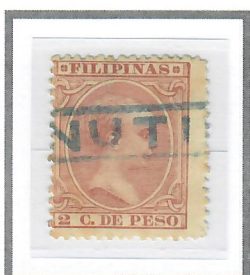
2c Claret (1894) Cliché I – Scott #144