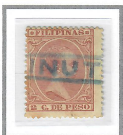
2c Claret (1894) Cliché II – Scott #144