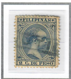
2c Ultramarine (1896) Cliché III – Scott #147