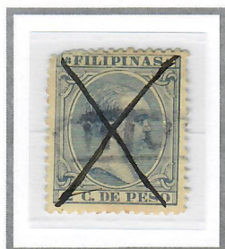
2c Ultramarine (1896) Cliché III – Scott #147