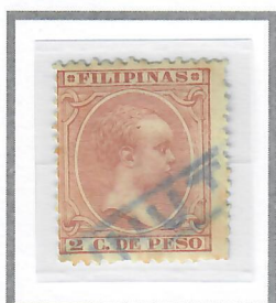
2c Claret (1894) Cliché II – Scott #144