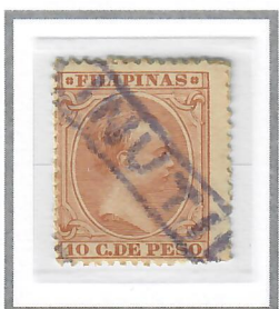
10c Yellow Brown (1896) Cliché III – Scott #166