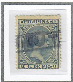
2c Ultramarine (1896) Cliché III – Scott #147