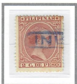
2c Claret (1894) Cliché I – Scott #144