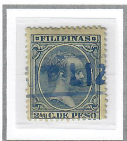
2-4/8c Dull Blue (1890) Cliché I – Scott #149