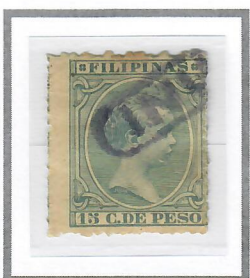
15c Blue Green (1896) Cliché II – Scott #171