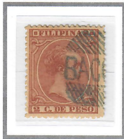
2c Claret (1894) Cliché I - Scott #144