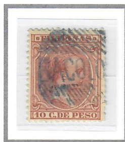
2c Claret (1894) Cliché II - Scott #144