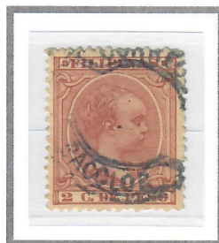
2c Claret (1894) Cliché II - Scott #144