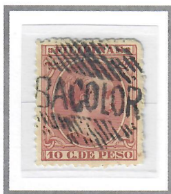
2c Claret (1894) Cliché II - Scott #144