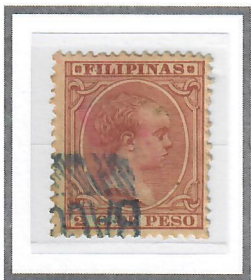
2c Claret (1894) Cliché II - Scott #144