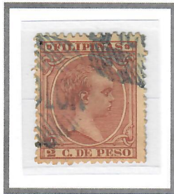
2c Claret (1894) Cliché I - Scott #144