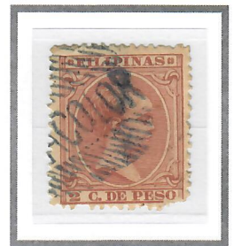
2c Claret (1894) Cliché I - Scott #144