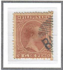
2c Claret (1894) Cliché I - Scott #144