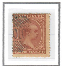
2c Claret (1894) Cliché II - Scott #144