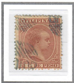
2c Claret (1894) Cliché II - Scott #144