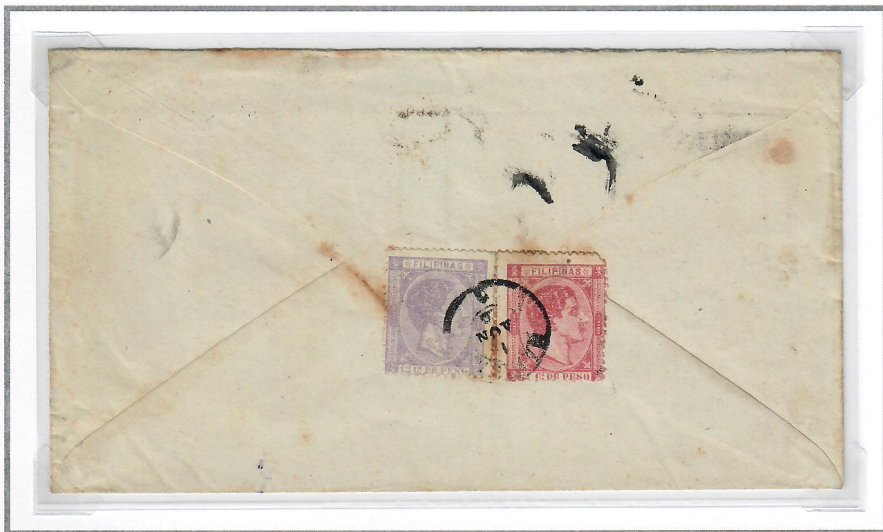
NOVEMBER 1, 1880(?) – MANILA TO RONDA (SPAIN) VIA GIBRALTAR Stamps Affixed to Back and Tied with 'Manila - *' Departure Circular Date Stamp Combined Usage with 12c Issue of 1876 for Payment of 14c (2c Overpaid for 12c Single Weight Rate to Spain) Inverted Month (NOV) in Circular Date Stamp