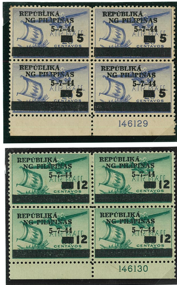
Plate No. 146129 (5C/20C stamp) & 146130 (12C/60C stamp)

Scarce Material: This is the only known proof of this issue.