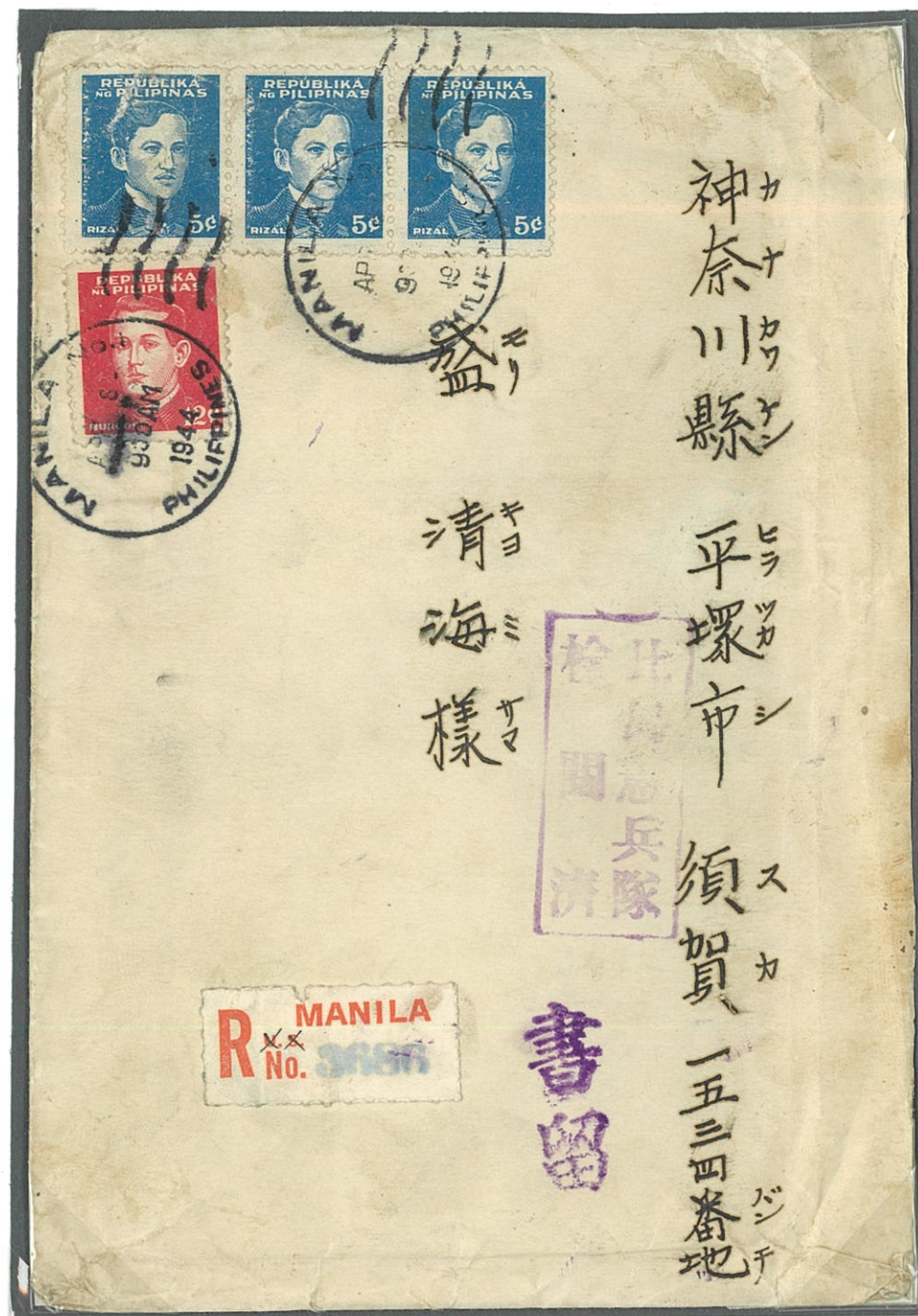
Apr. 8, 1944, Triple First Class Registered Mail Manila to Kanagawa, Japan Mix Franking of a horizontal strip of three 5C perforated stamps and a 12C perforated stamp for 27C triple first class mail rate. Scarce Usage: Multiple usage of this issue is seldom encountered.