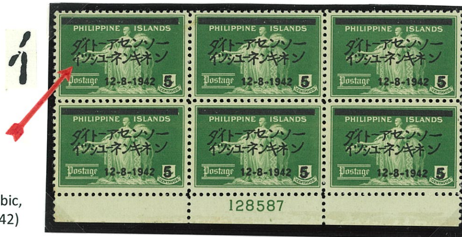
Plate No. 128587, 128588, 131541 & 131542

Variety: Broken "イ" Katakana Syllabic, the first in second row (Pos. 42)