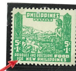
Variety: "O" of "FOR" broken (Pos. 2)