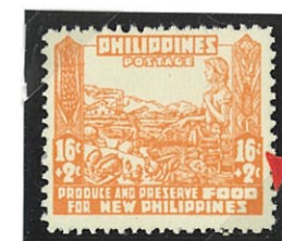
Variety: Part of "C" missing (Pos. 2)