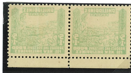
Error: Offset on back