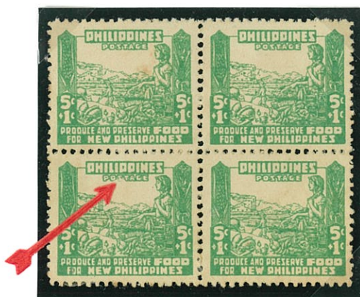
Variety: Part of "ST" of "POSTAGE" missing (Pos. 91)