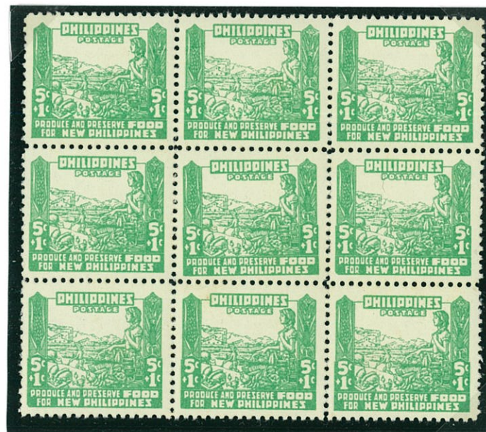
Variety: "Slanting Stamp" (Pos. 78)