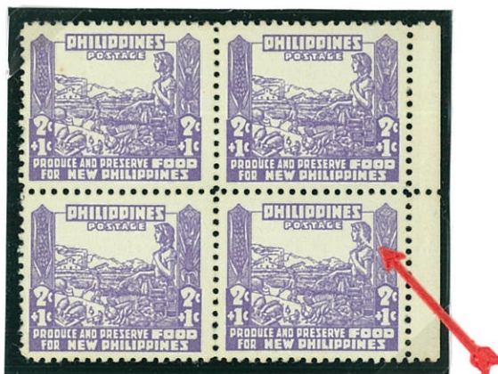
Variety: "Broken Neck" (Pos. 100)