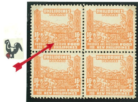
Variety: "Club-Footed" Rooster (Pos. 61)