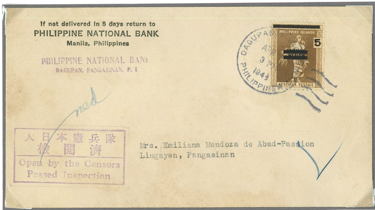
Apr. , 1943 (date unclear), Single First Class Mail, Dagupan Pangasinan to Lingayen Pangasinan Arrival Postmark dated Apr. 9, 1943 of Lingayen on the backside Censored at Lingayen, the boxed censor mark was same as the one used at Manila (Garret IA1) until Sep. 1942.