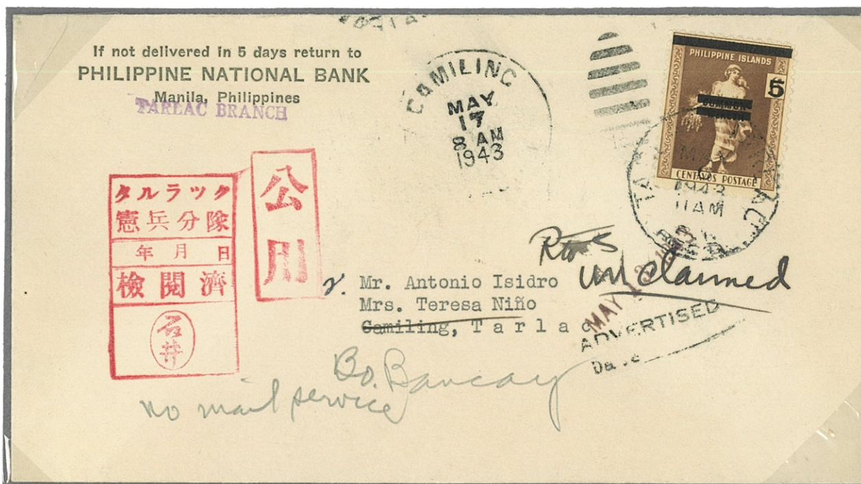
May 6, 1943, Single First Class Mail, Tarlac, Tarlac to Camiling, Tarlac

Most of this type of label were used for Prisoner of War or Civilian Internee mail matters and this is one of 2 known examples used for regular civil mail matters.