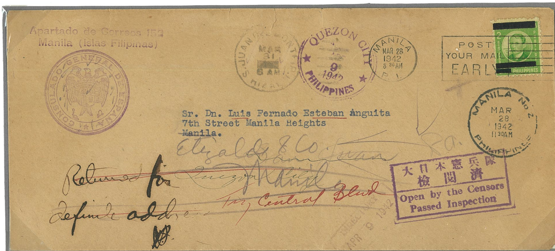
Mar. 28, 1942, Single First Class Mail from Consulate General of Spain, Manila Circulating